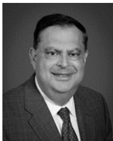
Director since: 2014